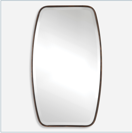
CANILLO MIRROR, BRONZE