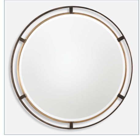
CARRIZO RECTANGLE MIRROR CARRIZO ROUND MIRROR