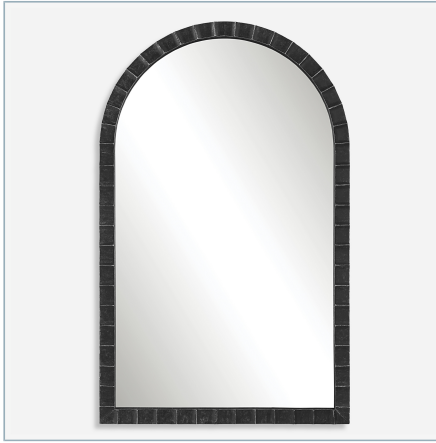
DANDRIDGE ARCH MIRROR, BLACK