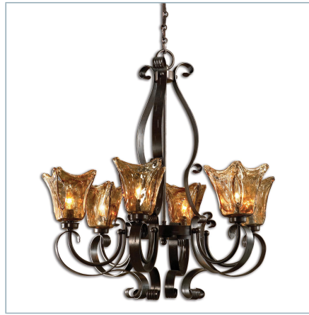
VETRAIO, 6 LT. CHANDELIER