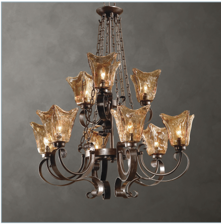
VETRAIO, 9 LT. CHANDELIER