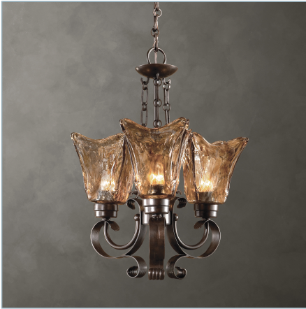
VETRAIO, 3 LT. CHANDELIER