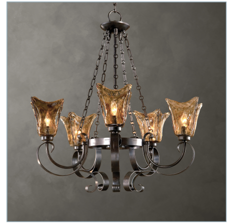
VETRAIO, 5 LT. CHANDELIER