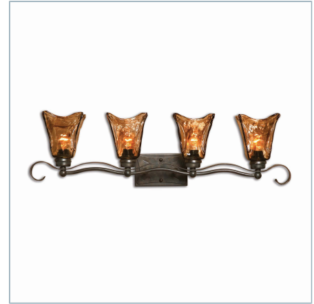
VETRAIO, 4 LT. VANITY