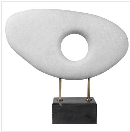
MINION SCULPTURE - STONE RECLINING