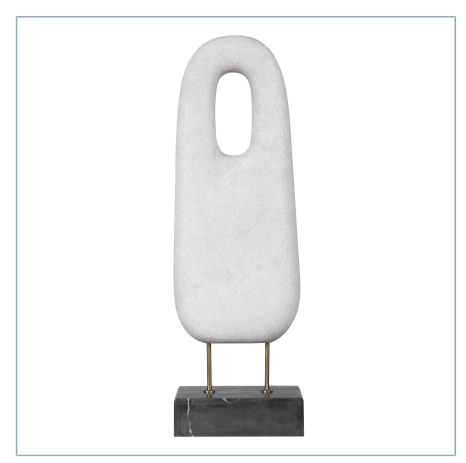
MINION SCULPTURE - STONE TALL