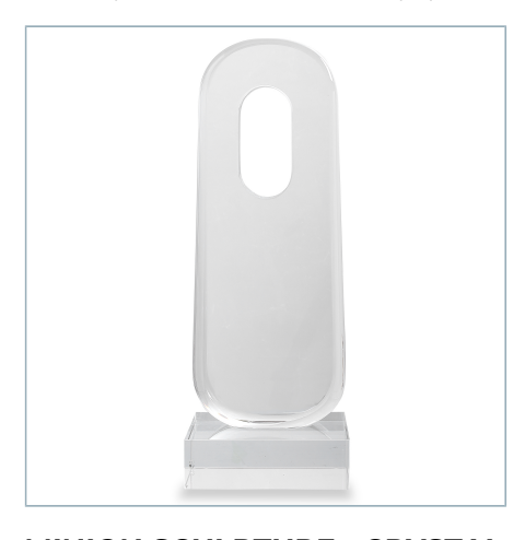
MINION SCULPTURE - CRYSTAL TALL