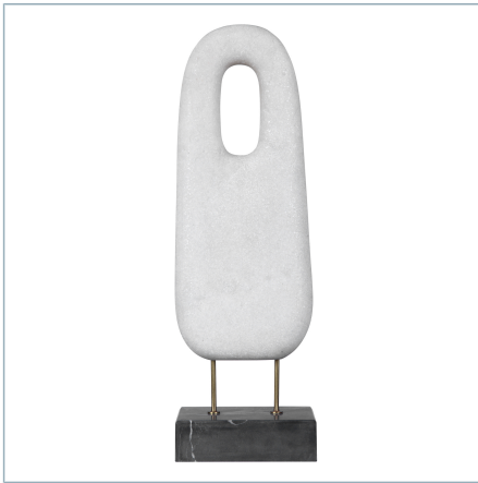
MINION SCULPTURE - STONE TALL