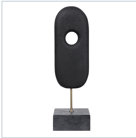
MINION SCULPTURE - STONE MEDIUM