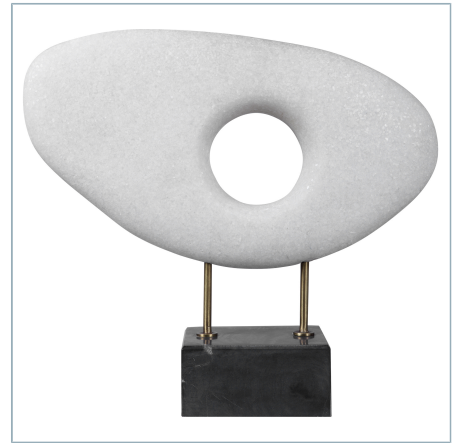
MINION SCULPTURE - STONE RECLINING