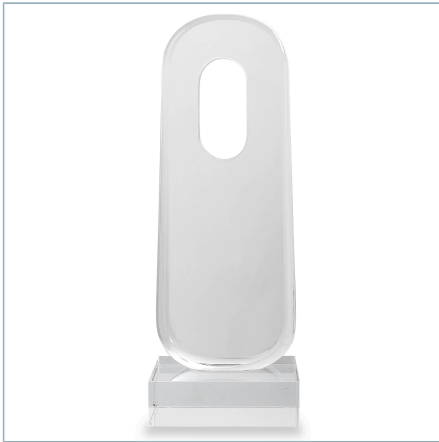
MINION SCULPTURE - CRYSTAL TALL