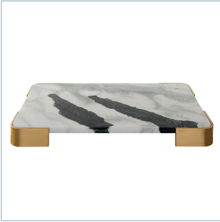
ELEVATED TRAY/PLATEAU - PANDA MARBLE MEDIUM