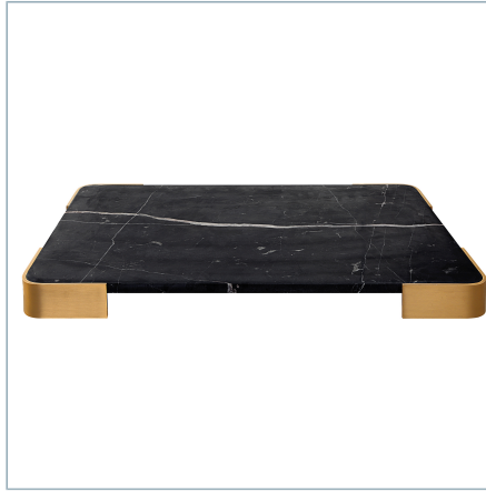
ELEVATED TRAY/PLATEAU - BLACK MARBLE LARGE