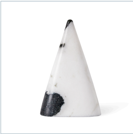
APEX SCULPTURE - PANDA MARBLE