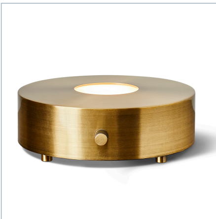
LIGHTED PLATEAU LAMP - BRASS