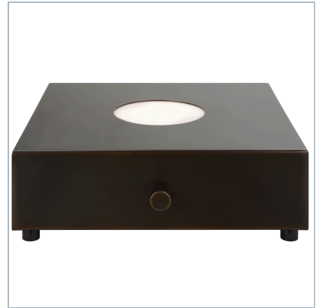
LIGHTED PLATEAU LAMP - BRONZE