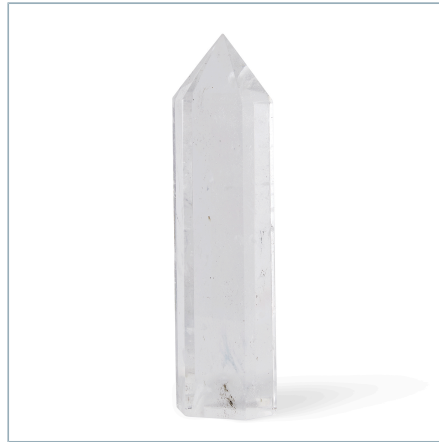
CRYSTAL POINT SCULPTURE