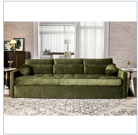
.SLOPE 90 INCH SOFA - ANTIQUÉ LODEN