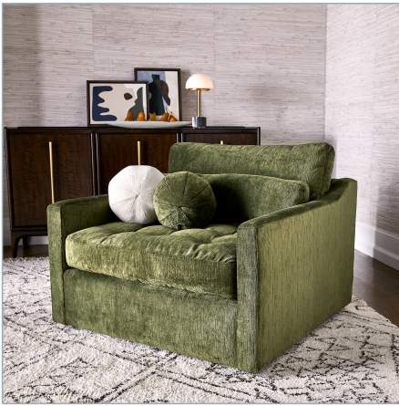
.SLOPE TUFTED SWIVEL CHAIR-AND-A-HALF - ANTIQUE LODEN