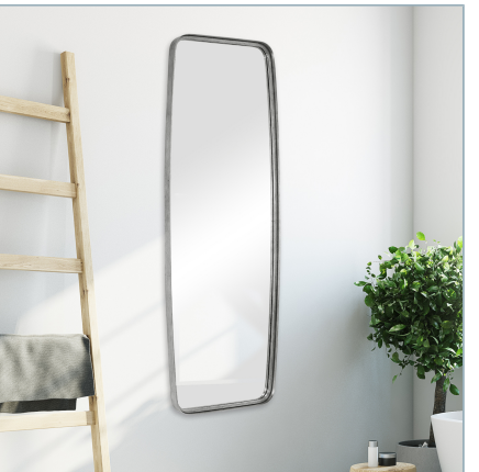
MIRROR W00517 | 21 W X 59.88 H (IN)